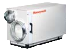
TrueDRY™ DH90 Whole-House Dehumidifier

Controls Humidification Terminals allow you to wire and control bypass, flow-through or steam humidifiers.